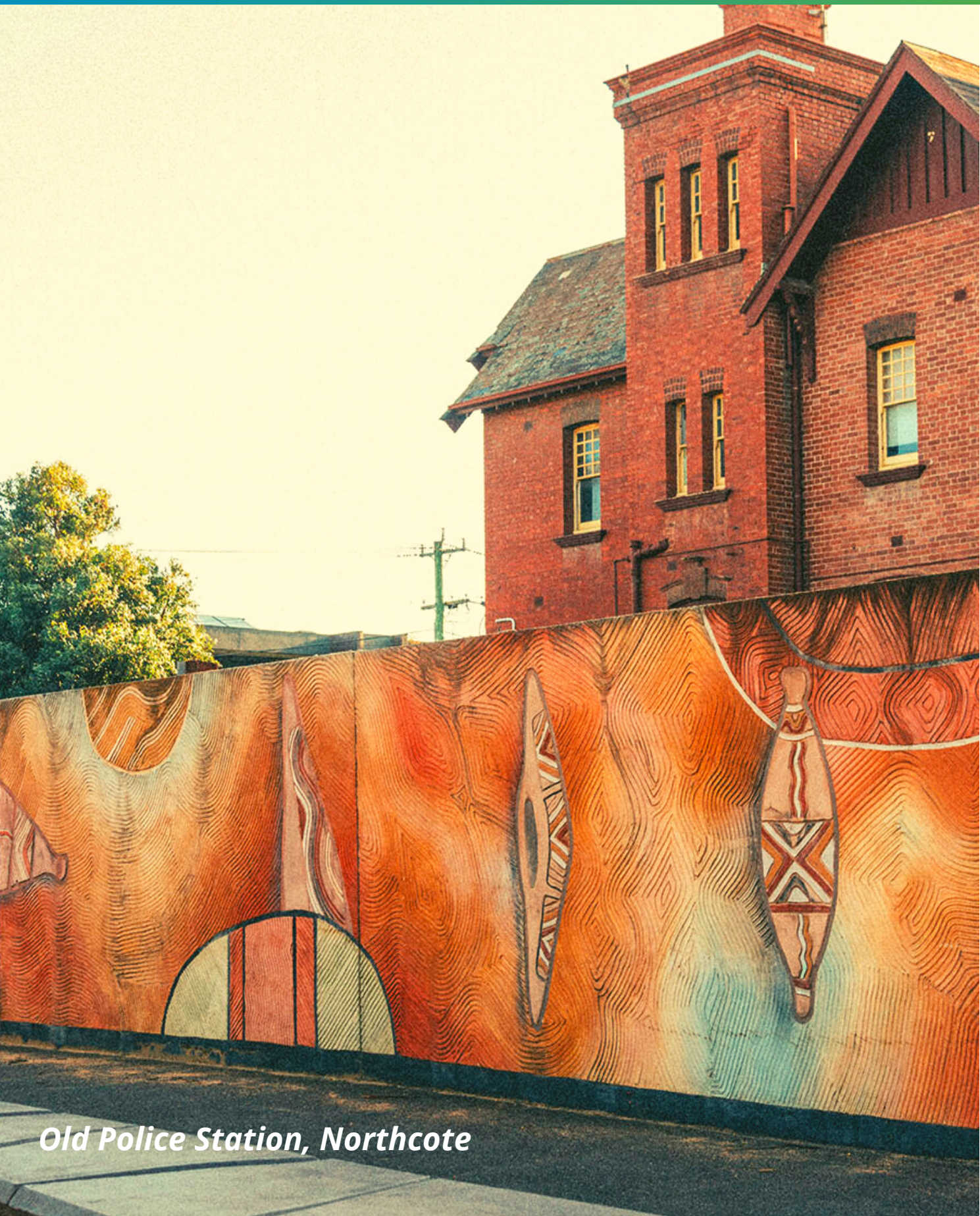
Old Police Station, Northcote