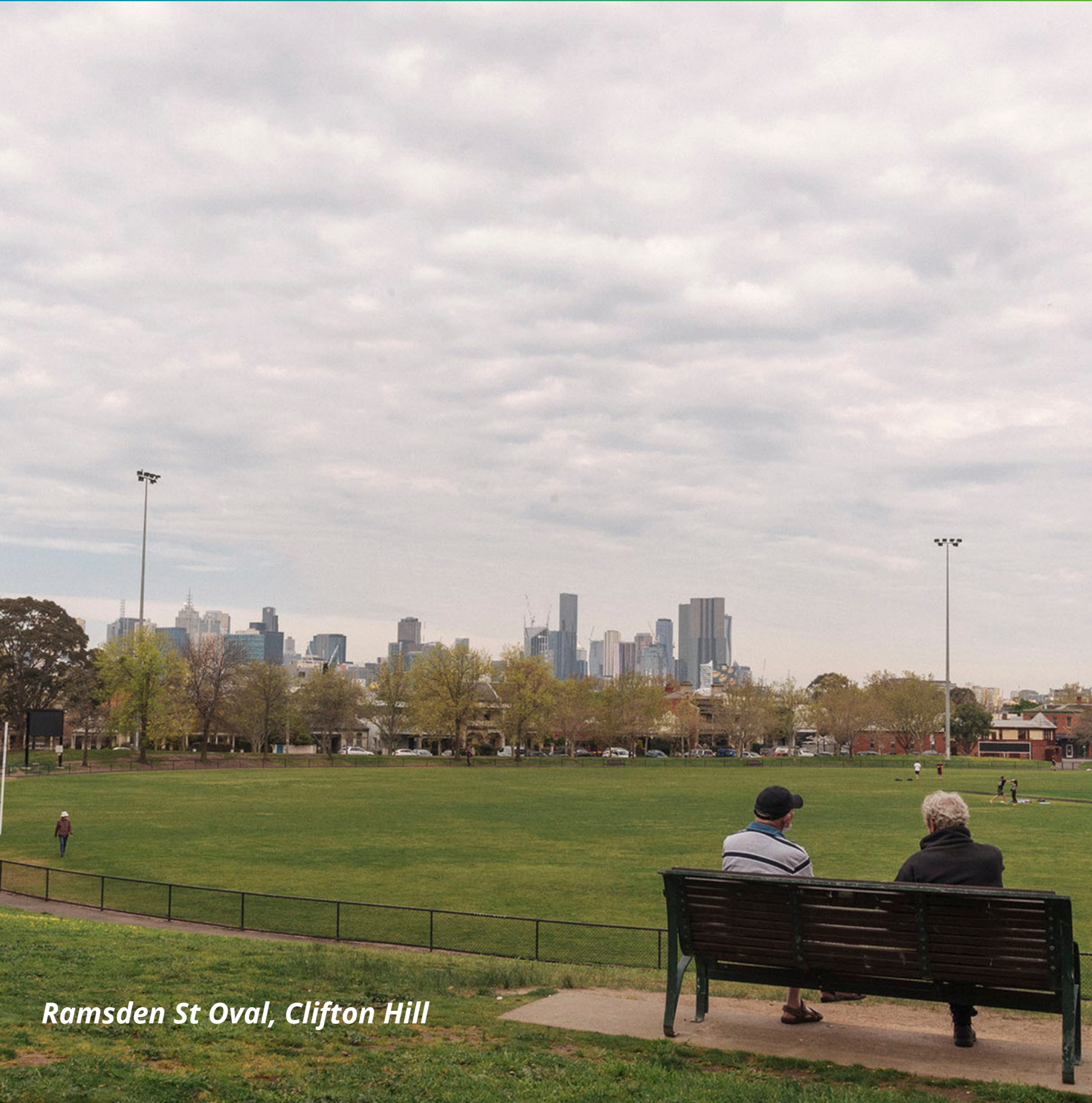
Ramsden St Oval, Clifton Hill