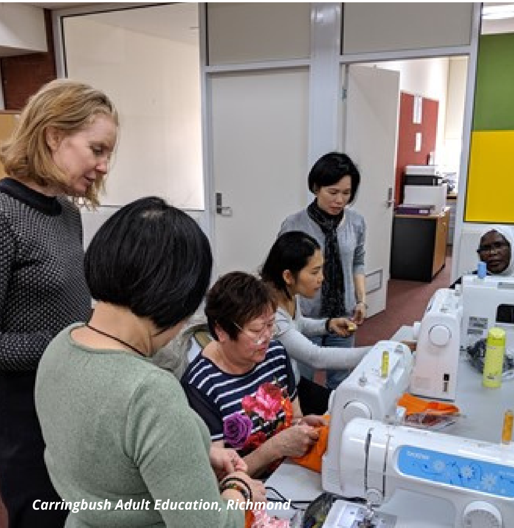
Carringbush Adult Education, Richmond