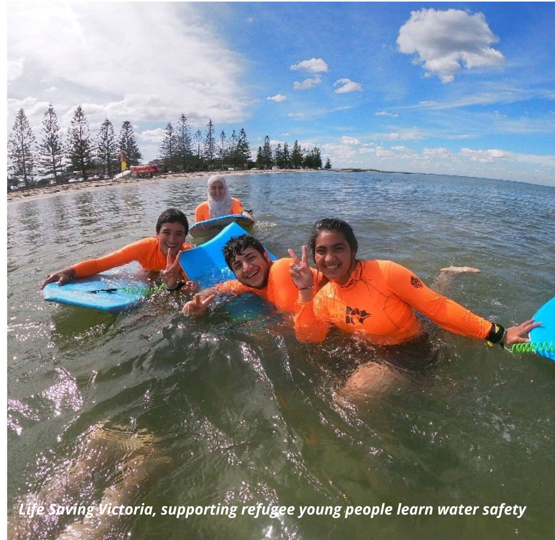
Life Saving Victoria, supporting refugee young people learn water safety

As summer is approaching and facilities are crying out for staff, our 9 program participants are in a fantastic position to secure employment in the coming months. At time of writing, whist 4 of 15 of our trainees had attained employment , all participants of the MCC program (including the non-CALD youth segment