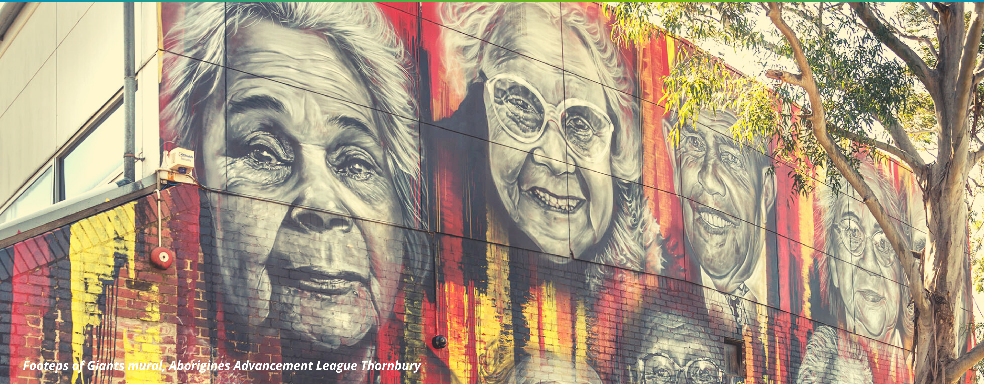
Footsteps of Giants mural, Aborigines Advancement League Thornbury

2020 Pathways to Employment Grants Feedback