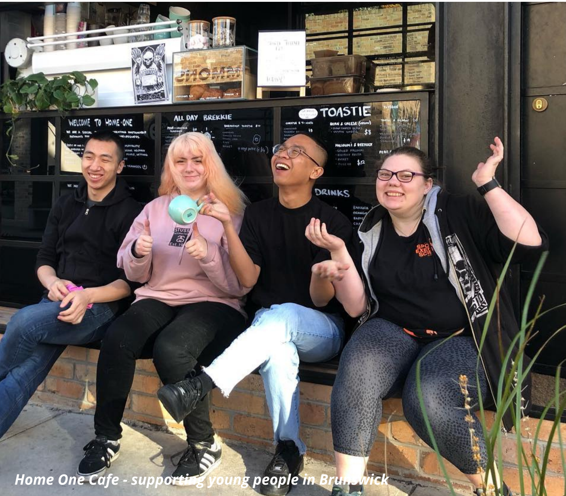
Home One Cafe - supporting young people in Brunswick