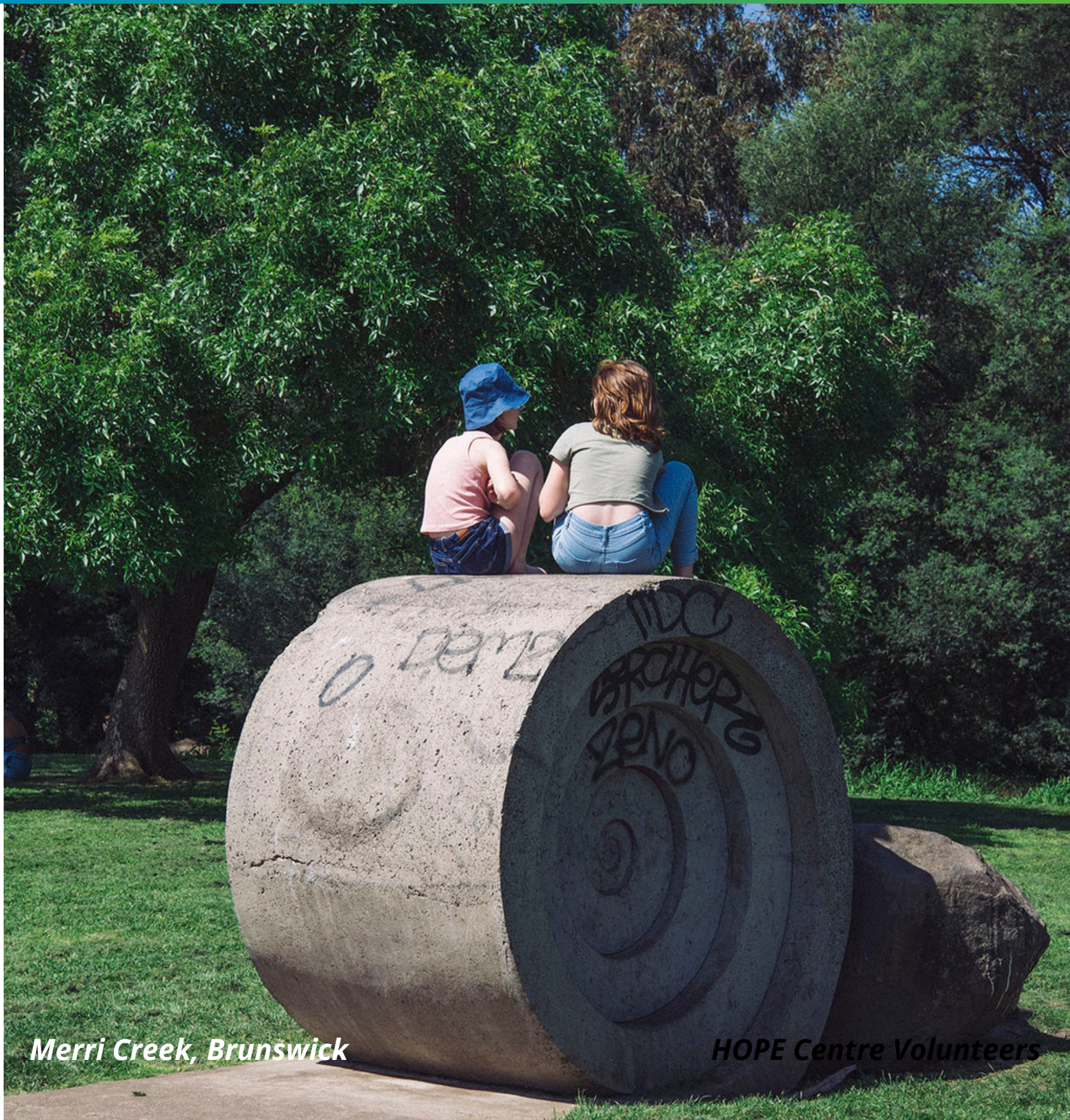
Merri Creek, Brunswick