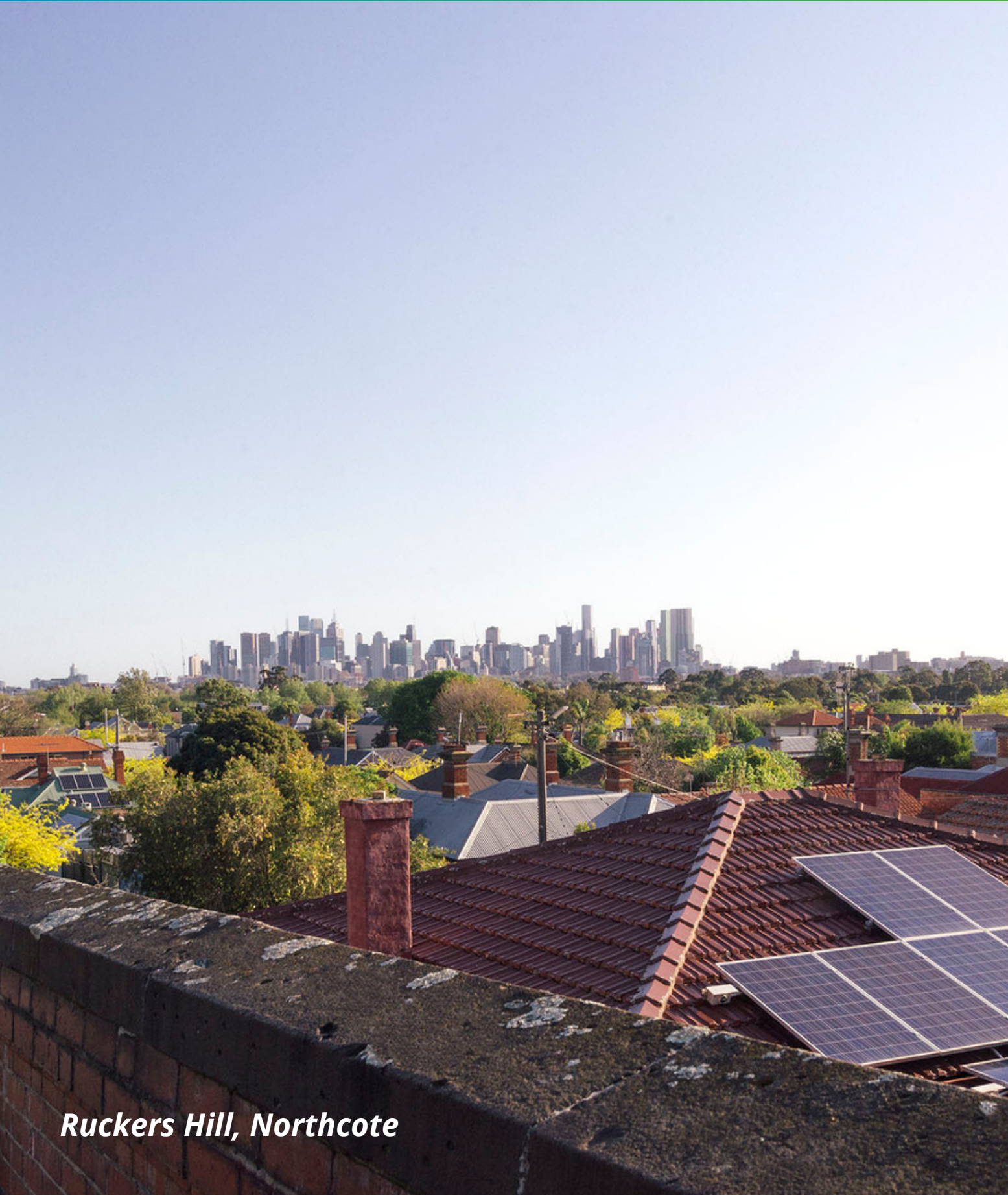
Ruckers Hill, Northcote